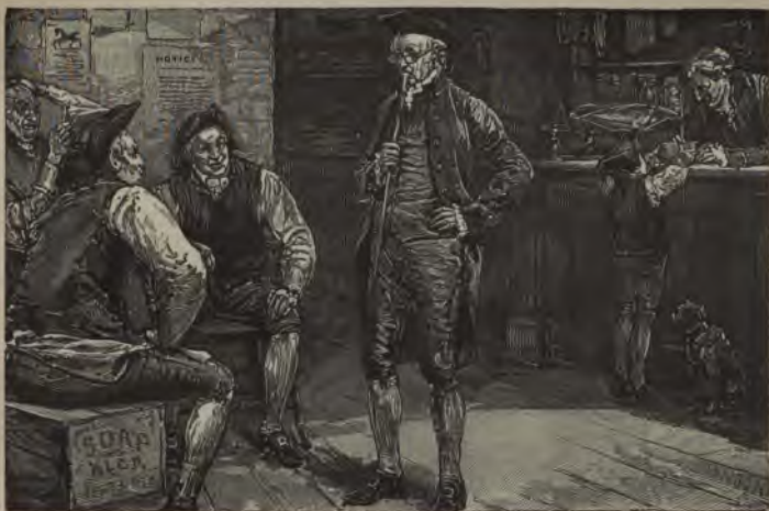
THE DEACON'S MASTERPIECE. Page 221.